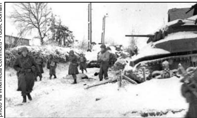
Members of the U.S. 117th Infantry Regiment, 30th Infantry Division, move past a destroyed American tank on their march to capture the town of St-Vith at the close of the Battle of the Bulge. St-Vith was largely destroyed during the ground battle and subsequent air attack. American forces retook the town on Jan. 23, 1945.

From among the Americans' peak strength of 610,000 troops, there were 89,000 casualties, including about 19,000 killed. The "Bulge" was the largest and bloodiest single battle