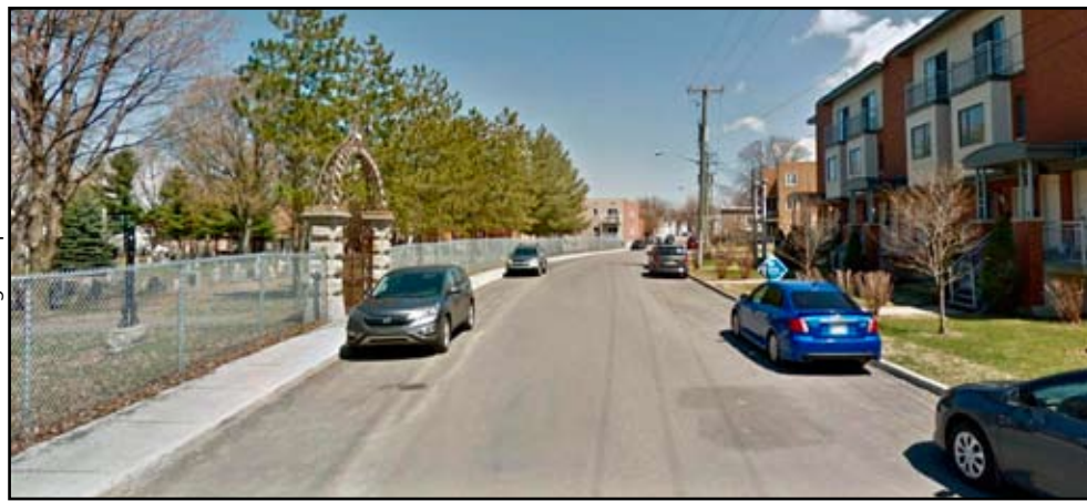
Rue des Ardennes is in the Saint-Sauveur district of the La Cité-Limoilou borough of Quebec City. It runs between Rue de la Jonquière and Avenue Lesage. The entrance to Cimetière Saint-Sauveur can be seen on the left.

The clash between the two sides lasted for more than a month, from Dec. 16, 1944 to Jan. 25, 1945. It was launched through the densely forested Ardennes region, with rough terrain, rolling hills and ridges, primarily in Belgium and Lux-