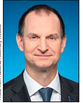
Éric Girard was named minister of finance and minister responsible for relations with English-speaking Quebecers when Premier François Legault announced his new cabinet on Oct. 20.