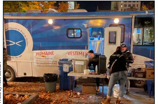
Volunteers from the Société Saint-Vincent-de-Paul distribute hot drinks at La Nuit des sans-abri.

away from live entertainment, but was adamant that she would be back next year to show support for the homeless community before the arrival of another unforgiving Québec winter.